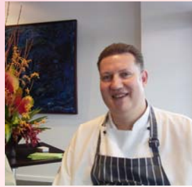
By Lance Rosen

Excited by all the new restaurants springing up across the City? Is it the lure of the unfamiliar, the unconquered, the sense of adventure, do we want to be seen at the latest eatery or boast of our experience at a joint that others didn't know even existed?