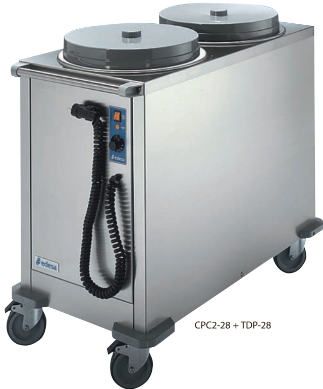
CPC2-28 + TDP-28